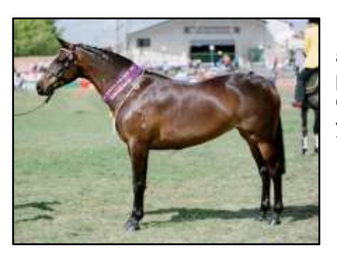
Smithfields Evening Ch RPSBS Mare RNA

ponies he saw by the imported English Riding Pony Stenigot Nightingale . Nightingale was exported to New Zealand as a two-year-old after having been Supreme Champion at the Ponies of Britain Show in 1978. The stud was able to obtain Glen Cree Classic (imp) , a black 14.1hh stallion from New Zealand by Nightingale that possessed refinement and size. Crossing Classic over the Gale Force mares produced extra height and refinement.