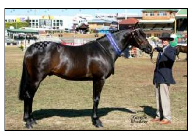
Garden Vale Stylish Image RNA 1995

In 2005 and 2006 we crossed some of our mares with the 12hh stallion Bradmore Toy Soldier (Imp) in addition to standing our Magistrate bred 15.2hh stallion Garden Vale Stylish Image who has had tremendous success in the show ring winning Championships at Brisbane, Sydney, Melbourne and Toowoomba Royals as well as the Arabian Nationals.