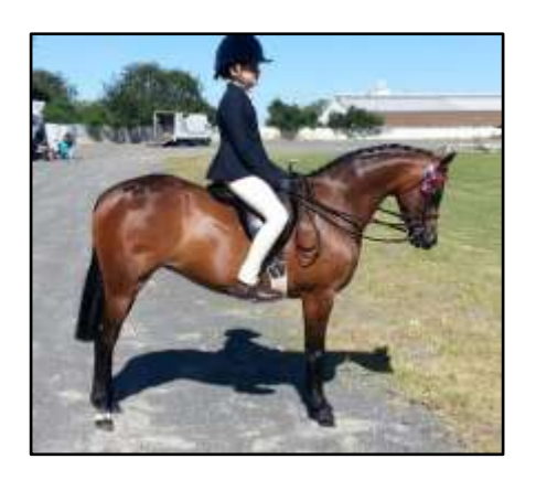
Smithfiels Evita by Toy Soldier